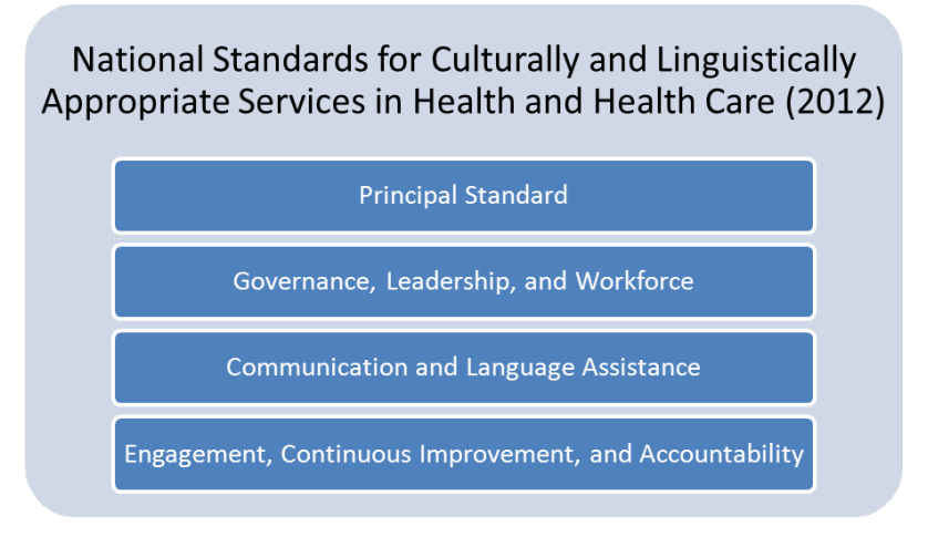
Figure 3: Enhanced National CLAS Standards' Themes

The enhanced National CLAS Standards elevate the previous Standard 1 to the status of a Principal Standard, add a governance and leadership Standard as Standard 2, and reframe the three themes.<sup>1</sup>